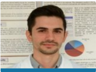
Chemical Engineer, MsC. of Science Technology and Applications of Ceramic Materials, Universitat Jaume I.